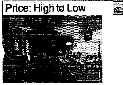
North City Area Condo/Townhouse $199,950

17900 23rd Lane Ne 204 Shoreline, WA 98155